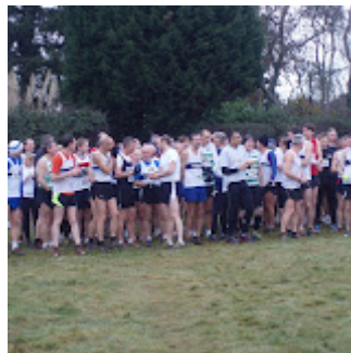
Ilford AC 10 miles xc - 31st Dec 2011 Club 10 Miles - 2nd January 2011