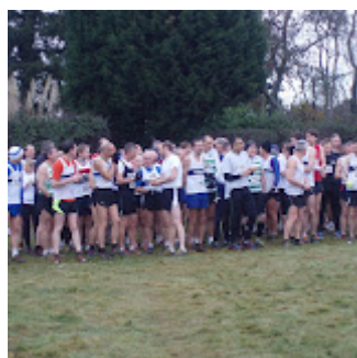
Ilford AC 10 miles xc - 31st Dec 2011 Club 10 Miles - 2nd January 2011