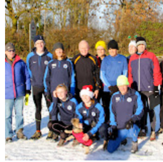
Boxing Day Handicap - 26th December 2010