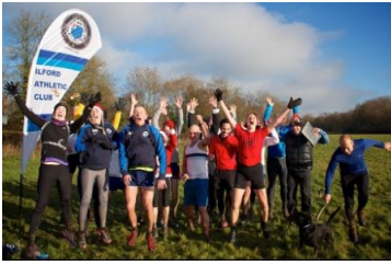
Ilford AC Boxing Day Handicap 2013