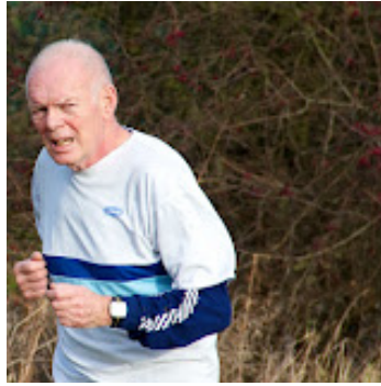
Ilford AC Boxing Day Handicap 2011