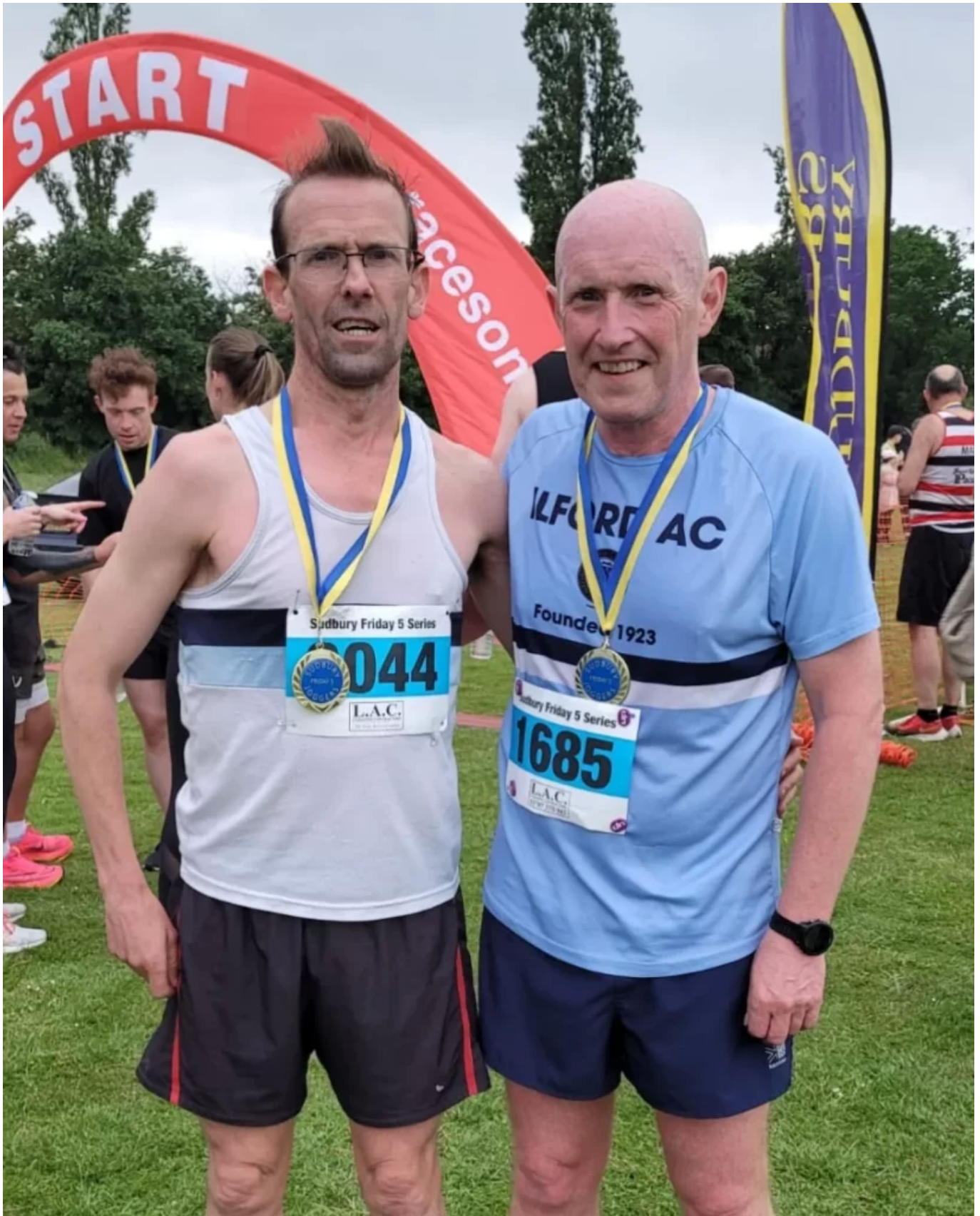
ROAD AND CROSS COUNTRY Sudbury Friday Night 5 Friday 31st May. Two Ilford athletes