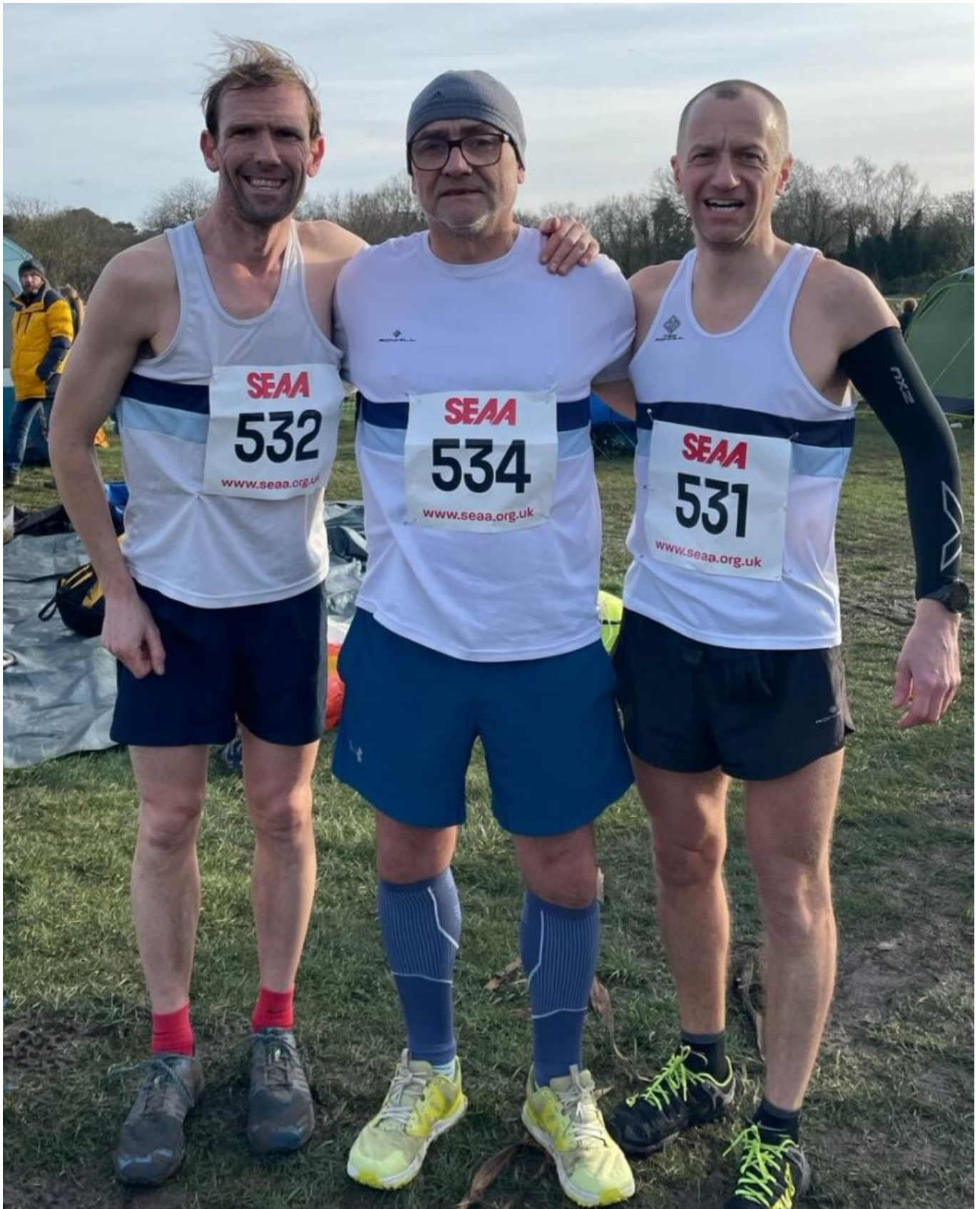
SOUTH OF ENGLAND CROSS COUNTRY CHAMPIONSHIPS Beckenham Place Park Saturday 28