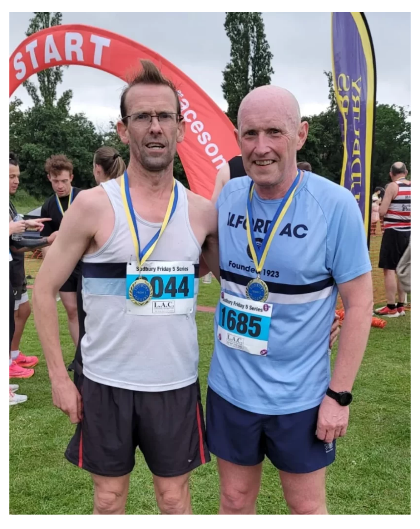
ROAD AND CROSS COUNTRY Sudbury Friday Night 5 Friday 31st May. Two Ilford athletes