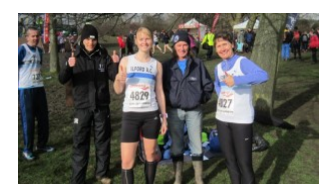
English National Cross-country Championship Parliament Hill Hampstead Saturday 21