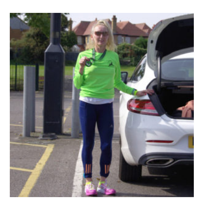
Ilford AC Press Report. September 25th 2017

Pleshey Half Marathon Sunday 24 September The Essex Half Marathon was once again held over a challenging one lap course on the country roads around the picturesque village of Pleshey, near Chelmsford, on a warm sunny morning. Ilford AC had a squad of 7 in action