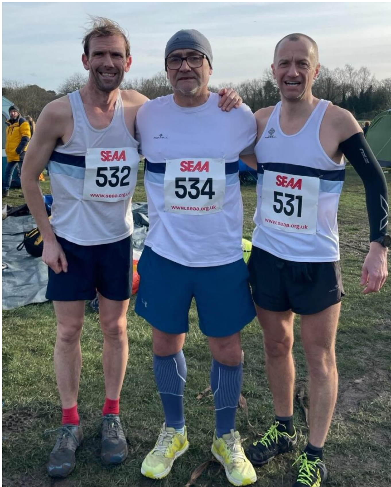
SOUTH OF ENGLAND CROSS COUNTRY CHAMPIONSHIPS Beckenham Place Park Saturday 28