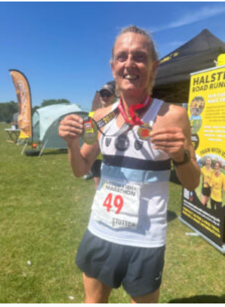
South Woodham Runners 10k