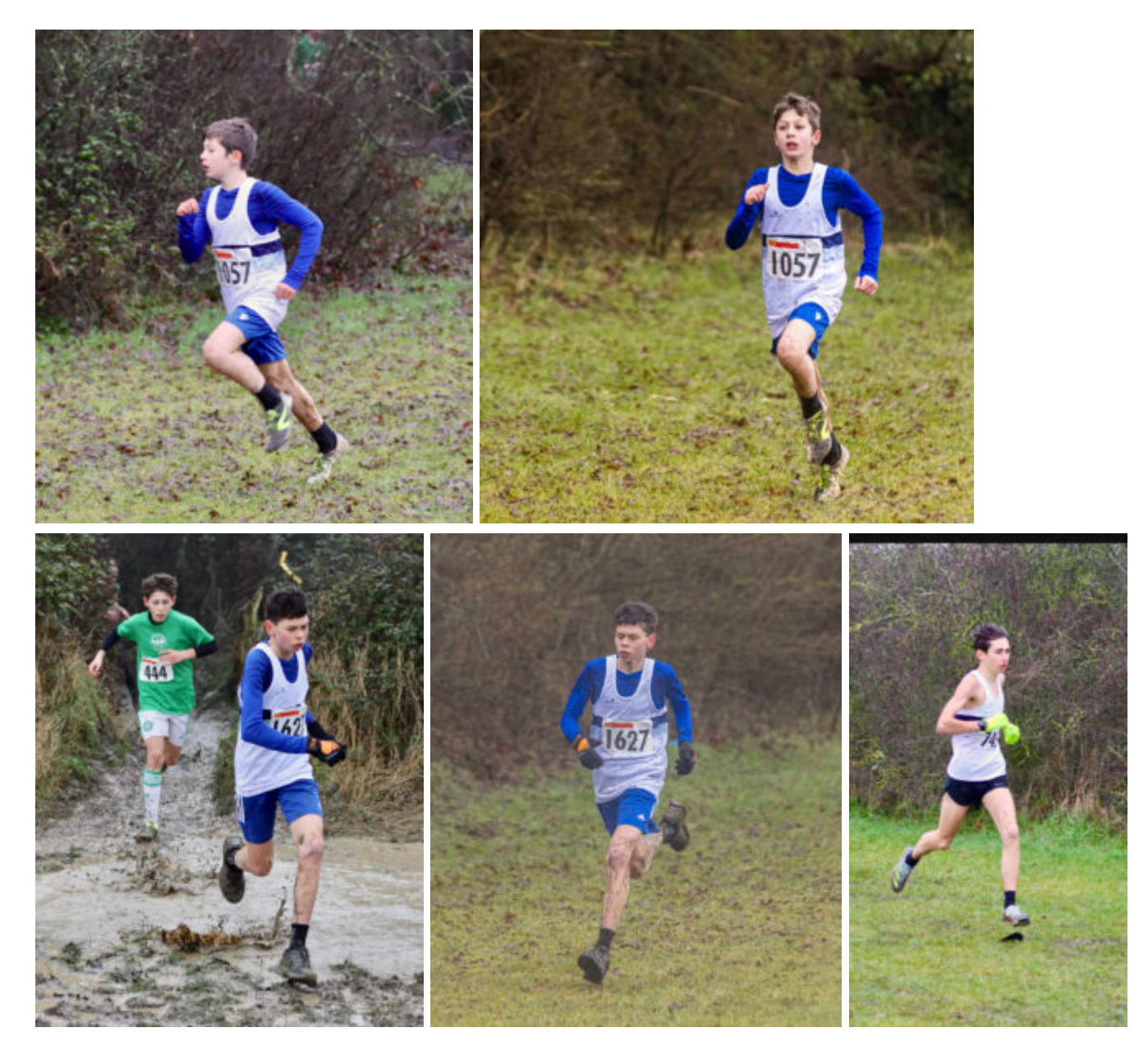
Mercury 10 Epping Forest

Saturday morning saw the 102nd running of the Mercury 10 in Epping Forest. Incorporating tough muddy hills the 10 mile race, whilst picturesque in places, is a real challenge for runners and one really only for the brave.