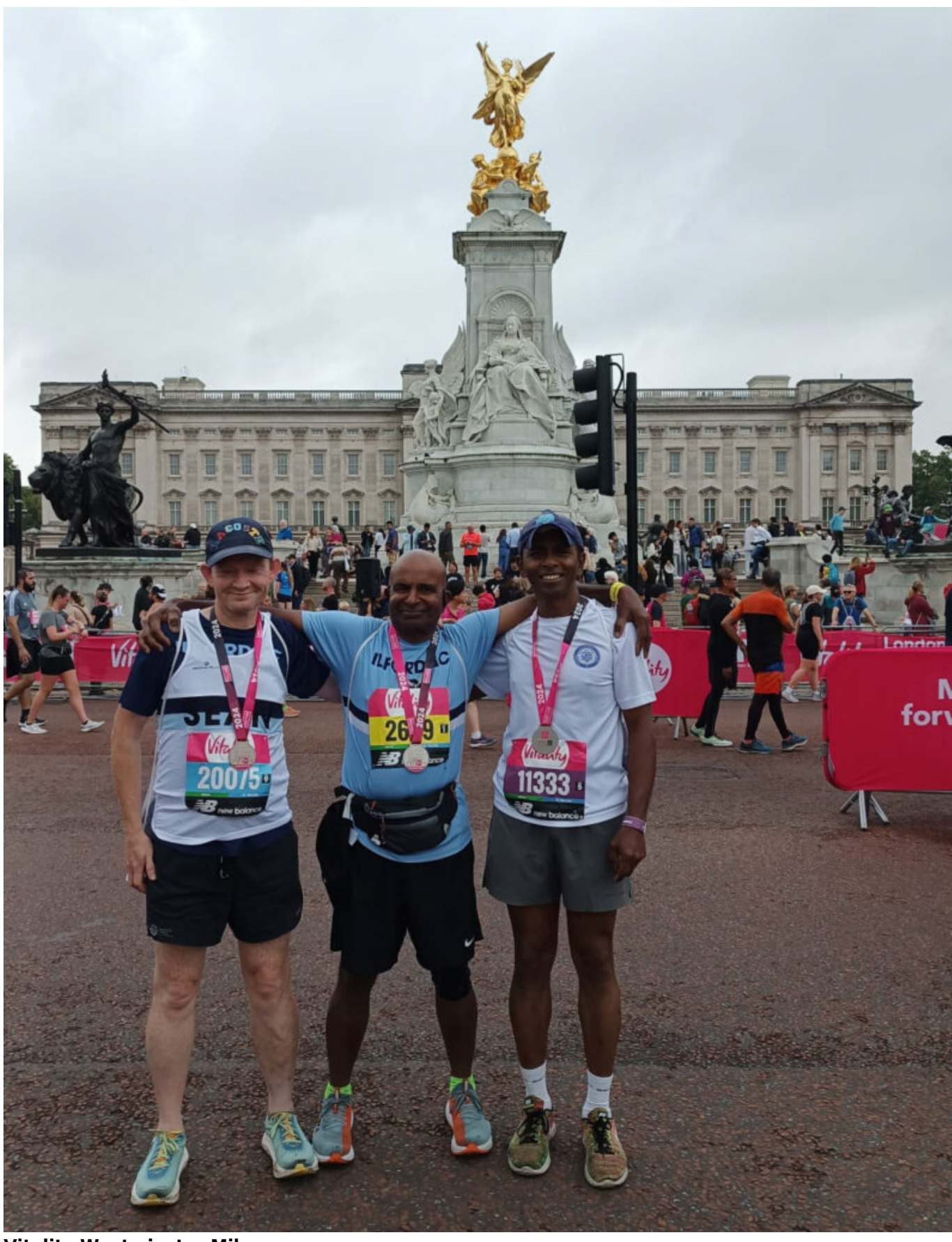
Vitality Westminster Mile