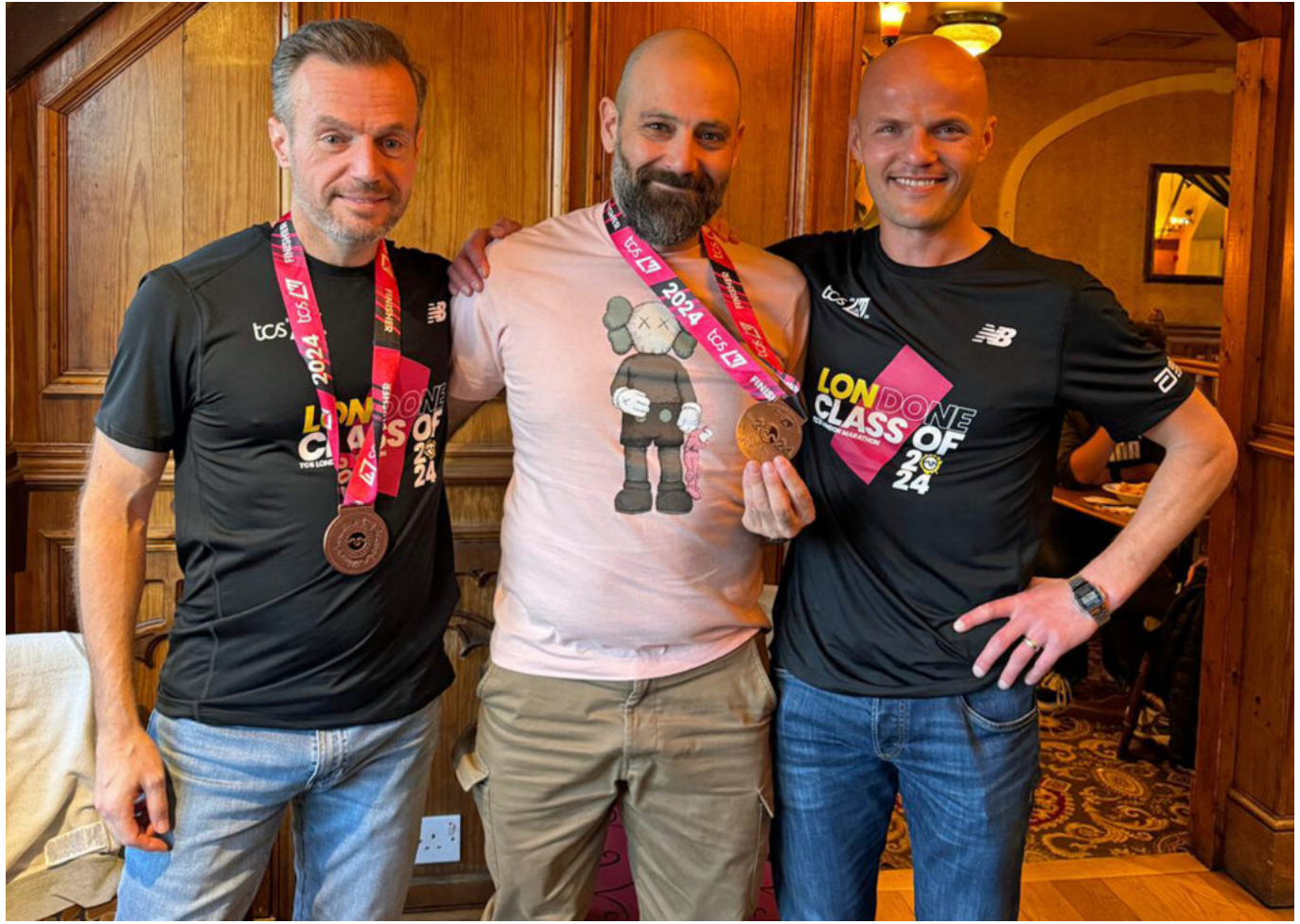
Eastern Young Athletes League (EYAL)

Ilford AC sent a team of 29 young athletes to the first EYAL match of the year in Ware