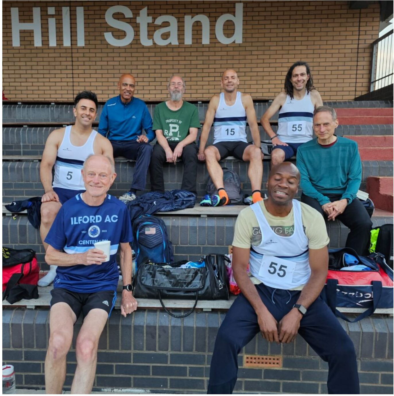
Richmond 10km (incorporating the VAC Championship) Sunday 25 June

Last Sunday the Richmond 10km took place on a morning when the temperature was already in the high 20s at the 9am start time..