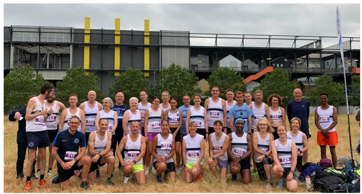
Open Track Meeting