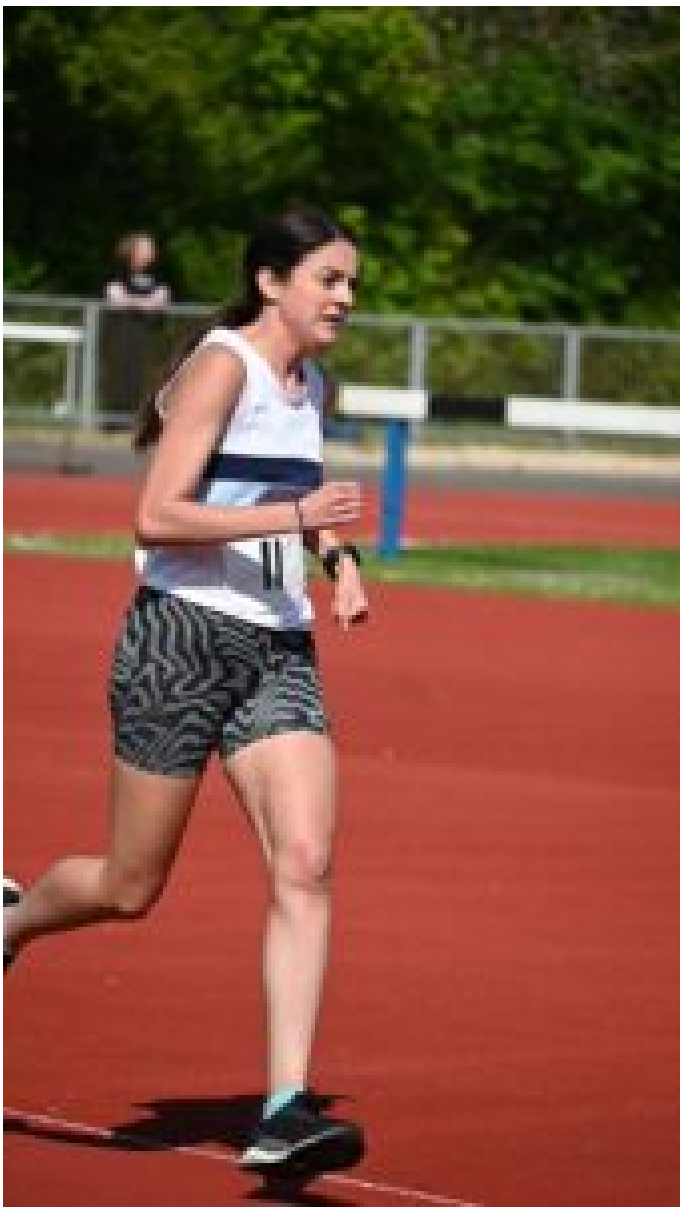
Hackney Half Marathon 21st May

The Hackney Half Marathon is one of London's newest, and largest halves with a record 19,800 athletes congregating on Hackney marshes for the early start.