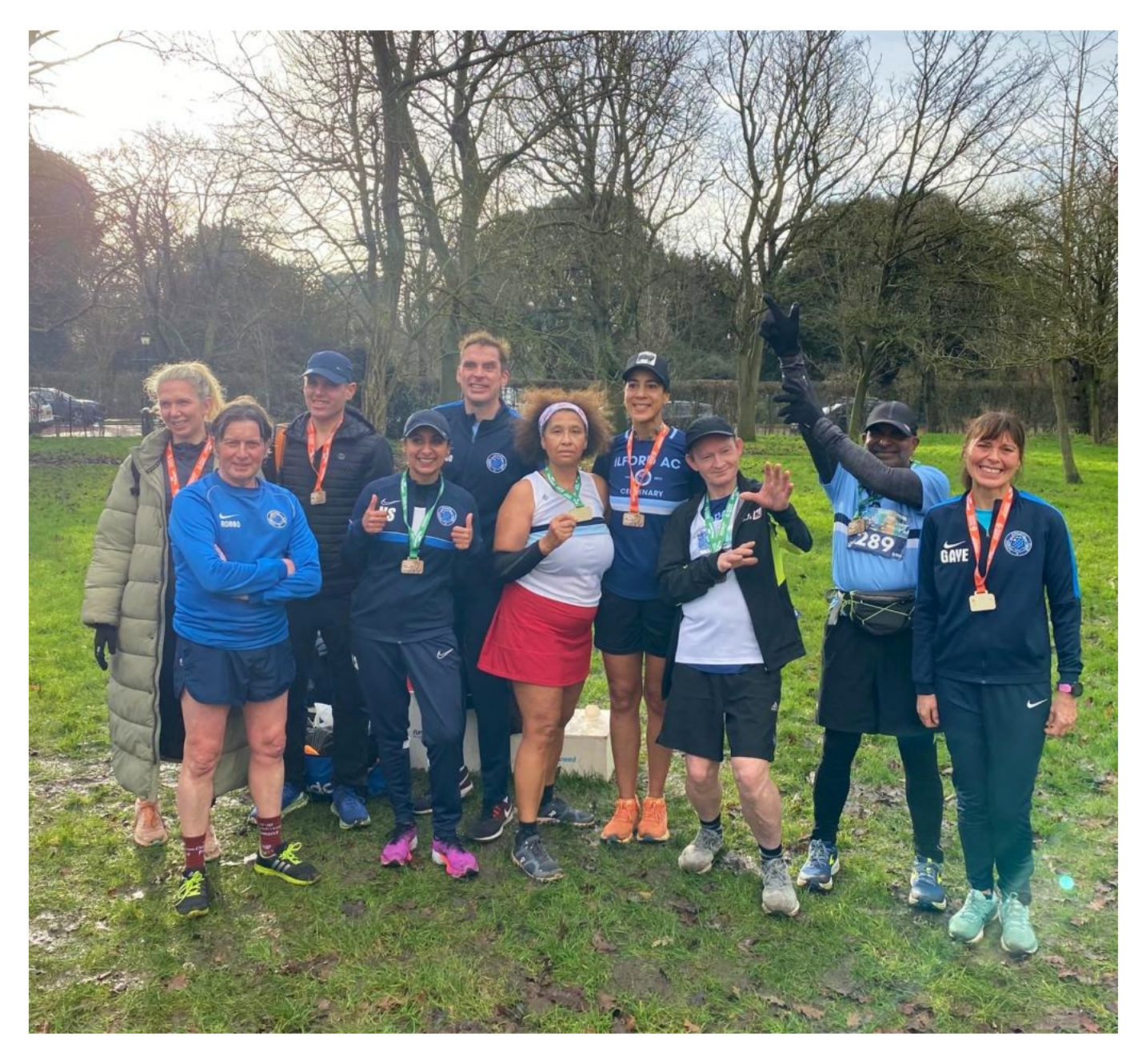
Mercury 10 Epping Forest Saturday 14th January

Saturday morning saw the 100th running of the Mercury 10 in Epping Forest.