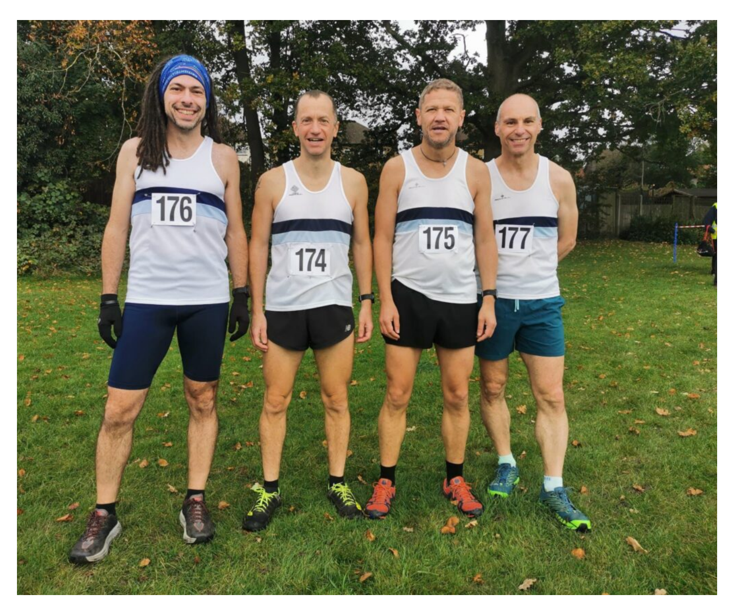
Billericay 10k Sunday 7th November

On Sunday Two intrepid Ilford AC athletes travelled to the Essex Town of Billericay to compete in the 25th Annual Billericay Striders 10Km Road Race.