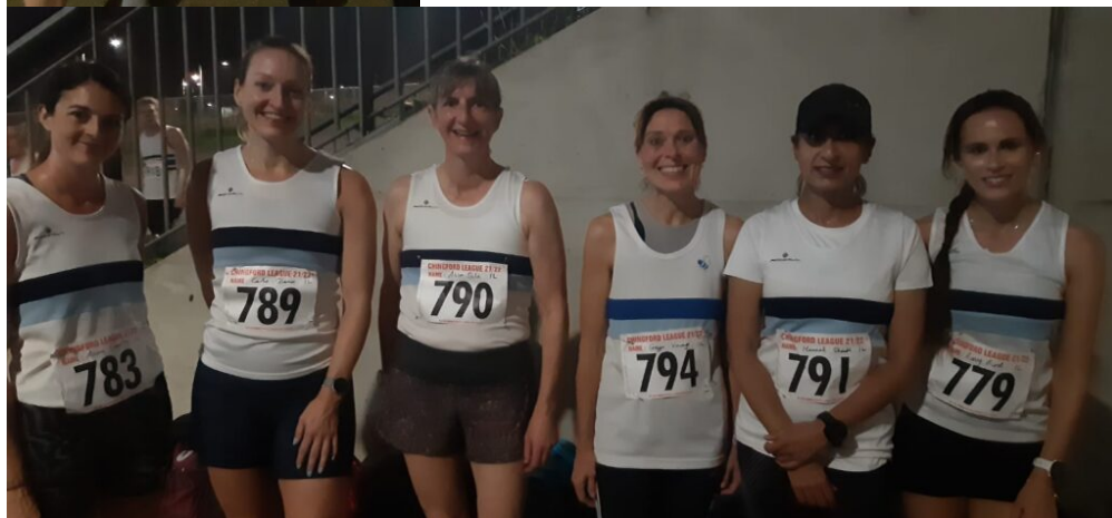
SEAA Cross Country Relays