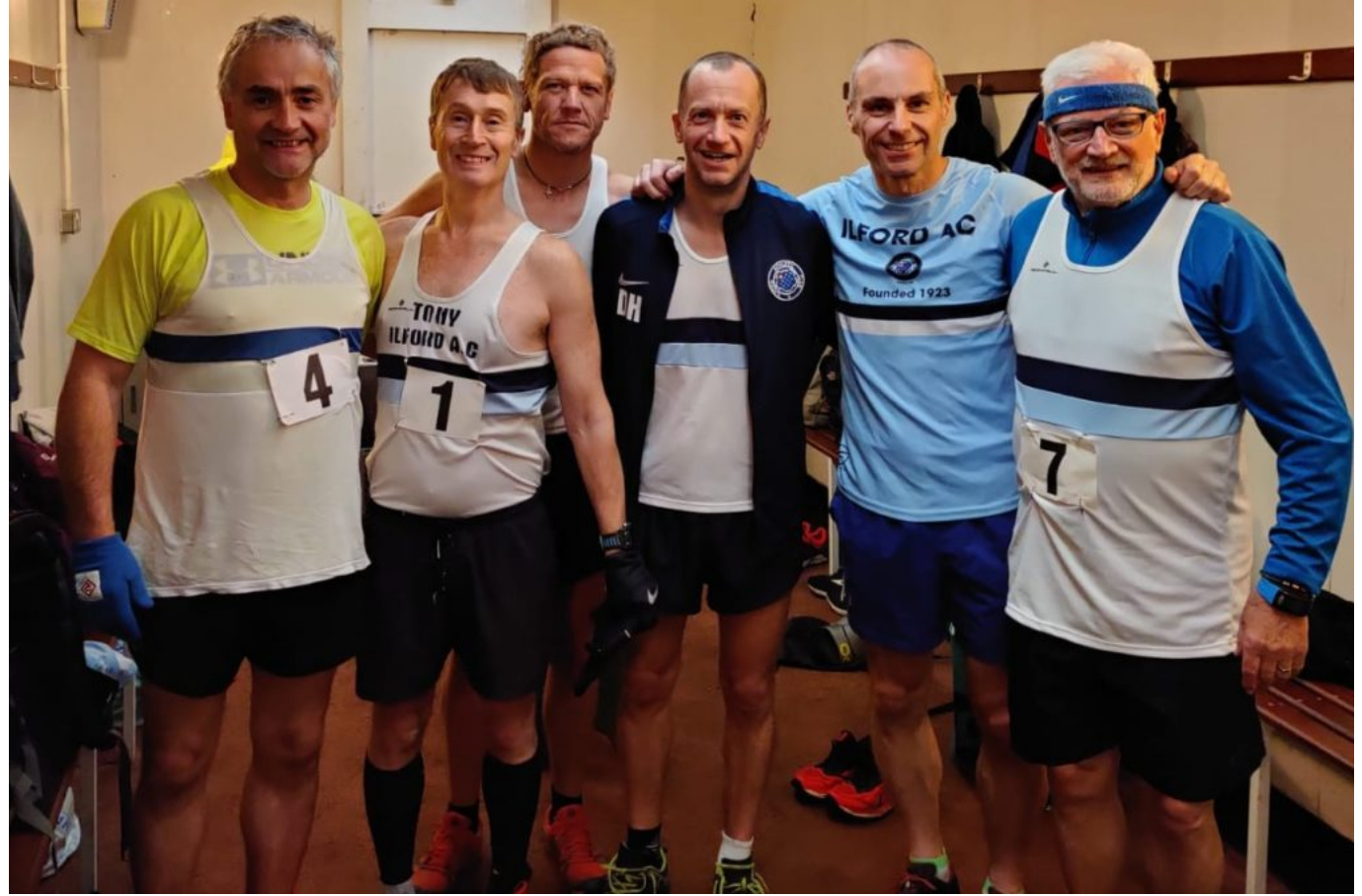
Billericay 10km Sunday 3rd November