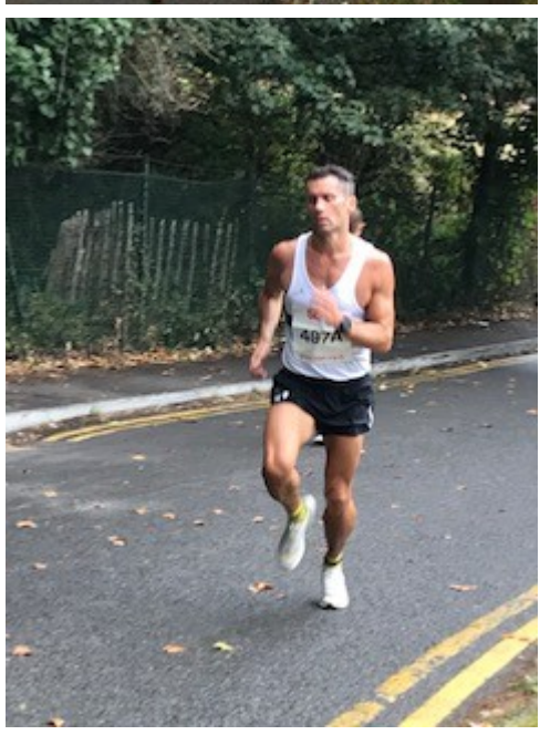
Ingatestone 5 Sunday 22 September

There were 9 Ilford Ac runners in this long established race.