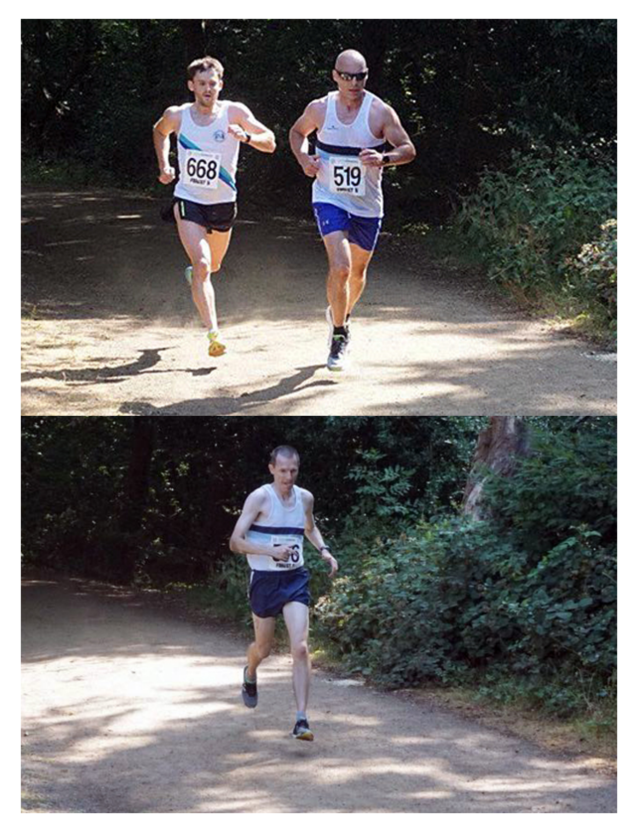
Essex Cross Country 10K Series Thorndon Country Park 14 July 2018